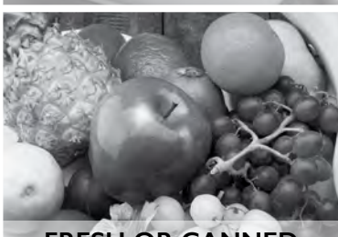
FRESH OR CANNED FRUITS & VEGETABLES