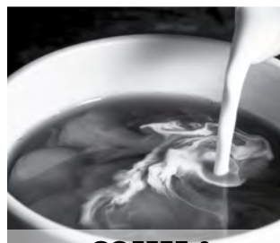
COFFEE & CREAMER