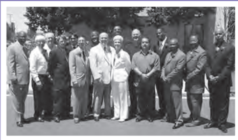
June 2010: congratulations Rescue Mission graduates!