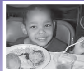
The Great Thanksgiving Banquet: thousands of meals were provided.